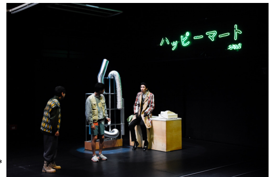
“Virtual Disorder” (2022)