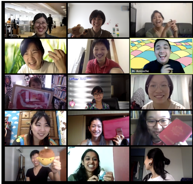
▲ Taken during the online programs of Tokyo Festival APAF2020 Lab